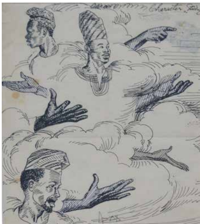
CHARACTER STUDY 2008, 9.5 by 8 Inches