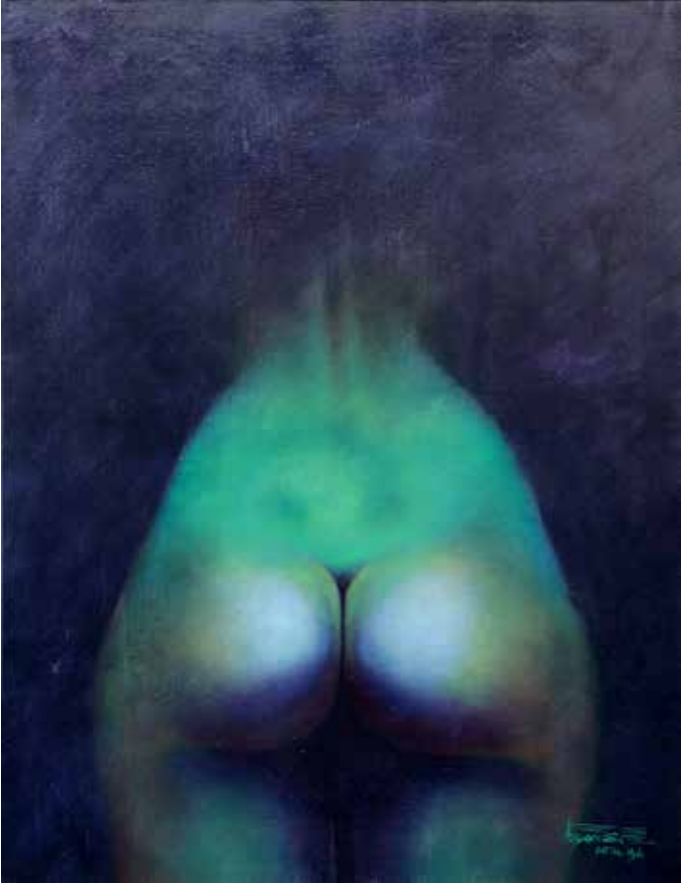
BODYSCAPE 1996, 33 by 24.75 Inches